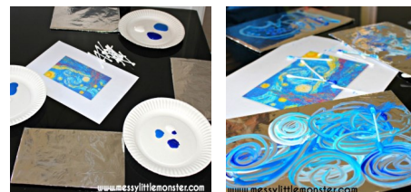
excerpted from messylittlemonster.com

Starry Night Art: Painting on foil is an easy process art idea for kids that's perfect for the winter months. This activity is great for toddlers and preschoolers working on fine motor skills and color mixing. Cover a piece of cardboard with foil for each child. For this art technique, use Q-tips as paint brushes. Inspire your artists with a copy of Vincent van Gogh's Starry Night painting to look at, then provide different shades of blue acrylic paint. Encourage the children to explore swirling the paint around the foil with the Q-tips, which gives the artwork a real winter feel.