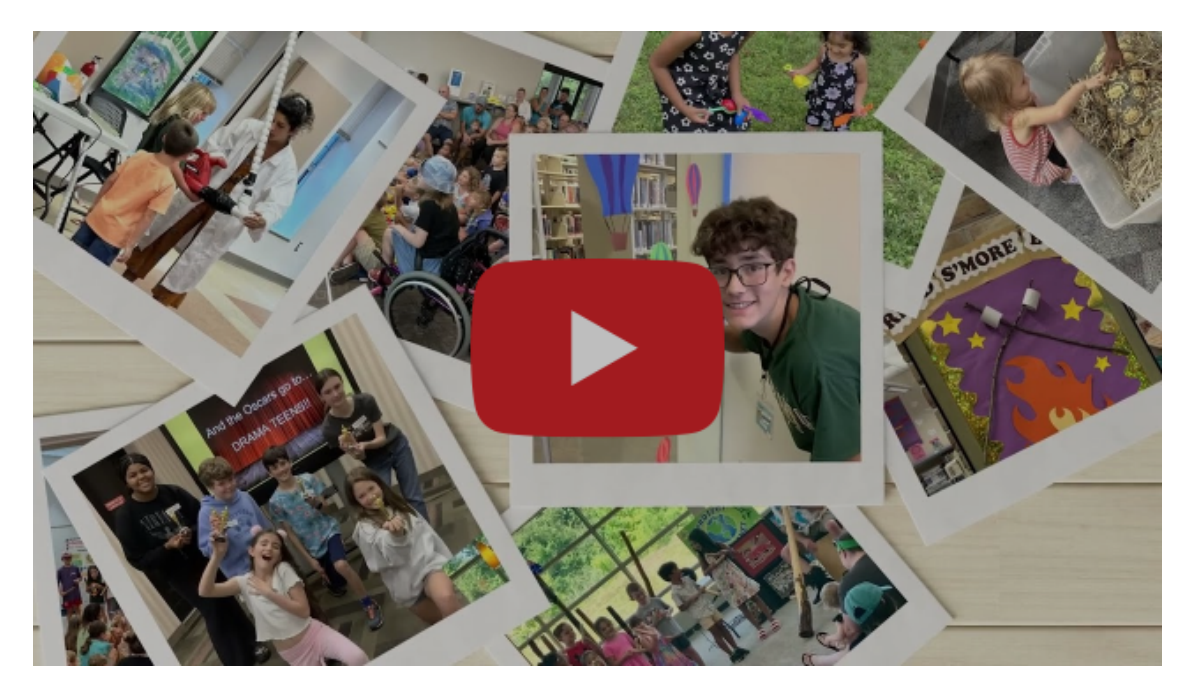
Thank you for an amazing Summer Reading 2024!

From exciting programs to discovering new favorite books, our community of readers made this summer one to remember. Check out the highlights and celebrate with us as we wrap up another incredible season of Summer Reading fun! A heartfelt thank you to all of our participants, staff, volunteers, and sponsors.